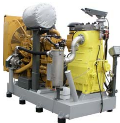
Typical high pressure pump units